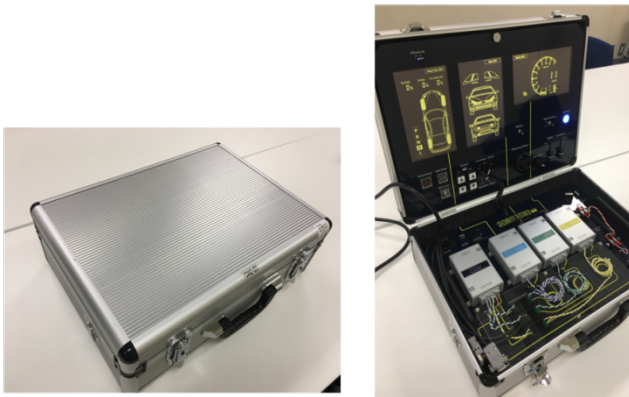
Figure 2: PASTA in attaché case

Because our ECUs use a general-purpose microcomputer, it is easy to prepare the development environment. Since these ECUs can be programmed in C, it is possible for users to implement their proposed security technology in a short time. Since PASTA is equipped with attack surfaces, it is also easy to evaluate its security technology. Even though they use a general-purpose microcomputer, if users discover a vulnerability of the microcomputer, they have to report it to the correct facility in the appropriate manner.