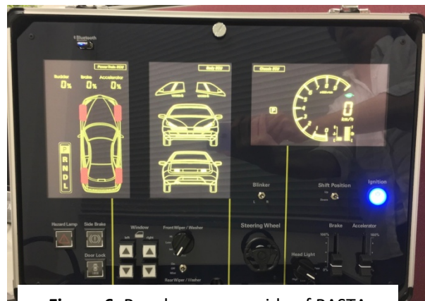
Figure 6. Panels on upper side of PASTA displaying vehicle status

A 1/10-scale model of a vehicle (Figure 7) is suitable as an actuator. This scale model is connected to the testbed by Bluetooth® and receives the command of the actuator from the testbed. Even though it is compact, it is equipped with wipers, headlights, brake lights, blinkers, etc.