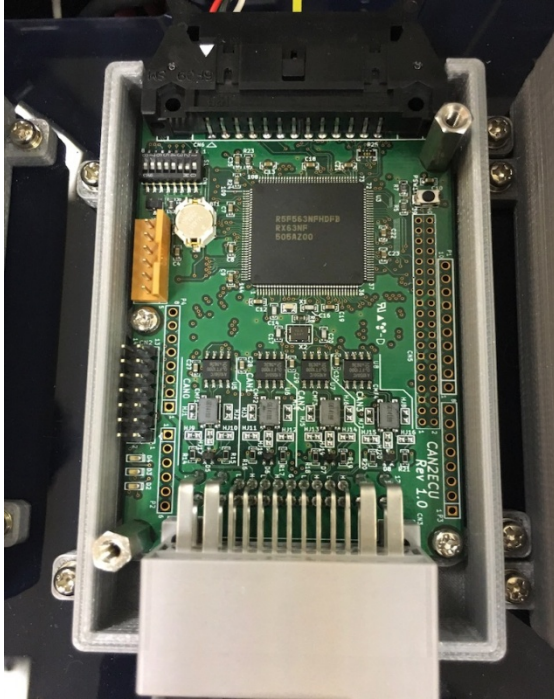
Figure 3. White-box ECU for PASTA