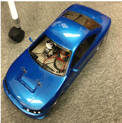
Figure 7. 1/10-scal model of vehicle connected to PASTA by Bluetooth®

PASTA is so compact that all the components can be stowed in one attaché case (Figure 2). This makes it possible to easily carry it and demonstrate research results in various places. Furthermore, because it is compact, it can be used as an educational tool of vehicle security even in small spaces. Since there is no full-sized actuator and the behavior can be confirmed with the software vehicle simulator, even if the vehicle behaves unexpectedly when an attack is reproduced, users remain safe because the vehicle is a simulation.