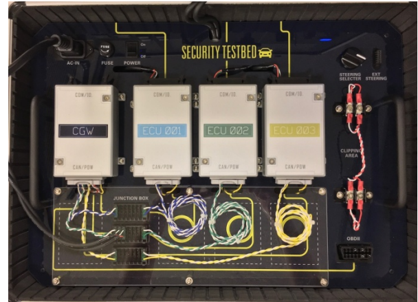
Figure 4. Embedded ECUs in PASTA. Leftmost ECU is central gateway (CGW), and other three on right control powertrain, body, and chassis domains

We equipped the OBD-II port, junction box, and area for wiretapping with clips as typical attack surfaces. Through these attack surfaces, attacks, such as wiretapping CAN messages flowing between ECUs and injection of malicious messages, can be reproduced.