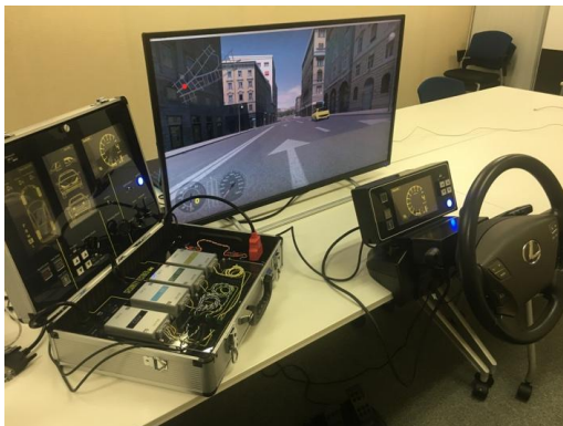
Figure 8. Driving simulator connected to PASTA